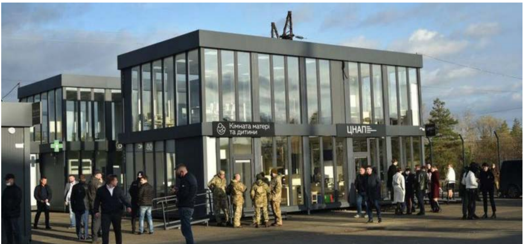
The Shchastia checkpoint in Luhans'k oblast.

While the issue of internal displacement is the main focus of TCUP's research, it is essential to understand how Russian policy has treated displaced people, including both those who fled violence in Donbas for Russia, and those who currently live in the non-government-controlled areas (NGCAs) and who may be seeking work or services such as health care. The COVID-19 pandemic has exacerbated the challenges for people living in NGCAs who may wish to go to Ukraine for health care, to access pensions, or for many other reasons, as the borders between Ukraine and the NGCAs were closed in March 2020 and only a few checkpoints are currently open. In contrast, the border between the NGCAs and Russia never closed. Several policies changing the legal