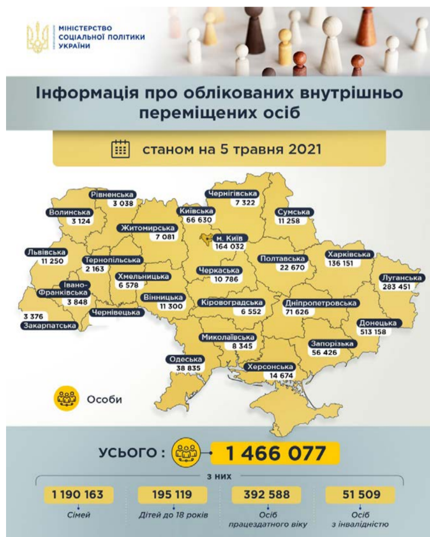
Information about registered IDPs as of May 5, 2021. Data from the Ministry of Social Policy of Ukraine.

This framework is useful for thinking about the experiences of displaced people in Ukraine. Çağlar and Glick-Schiller advocate for focusing on the migrant experience, rather than assuming a binary distinction between migrant and non-migrant (2018:5). In Ukraine, even though internally displaced populations may be known to have the same ethnic and religious background as other Ukrainians, they may still be treated as others in different cities and regions of Ukraine. Their sense of belonging to new places may be influenced by how people living in the receiving cities see them, based on linguistic and religious differences, as well as perceived differences in political opinions and affiliations. Importantly, researchers have documented different attitudes toward people displaced from Crimea versus those displaced from Donbas. Tetiana Bulakh notes that people who left Crimea were perceived as “ideological refugees” and were assumed to be resisting Russian occupation (2017:54). This perception was influenced by a number of factors, including previous forced deportations of Crimean Tatars, general support among Crimean Tatars for Crimea to remain part of Ukraine, and a lack of violent separatism from the territory. On the other